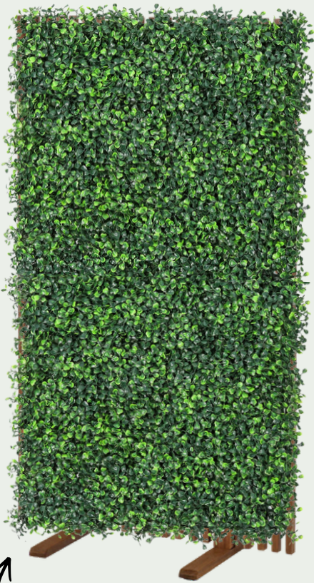
BOXWOOD HEDGE WITH BENCH